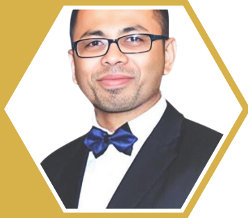
FOUNDER & LEAD CONSULTANT